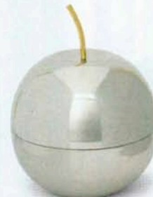
Aberdeen Apple iron-and-brass container by Arteriors, $270; arteriorshome.com .