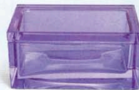
Crystal box by Moser for Asprey, $735; asprey.com .