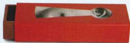
Serratura wood-and-metal box by Fornasetti, $395; barneys.com .