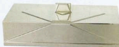
Arnett silver-plated brass box by Ralph Lauren Home, $695; ralphlaurenhome.com .