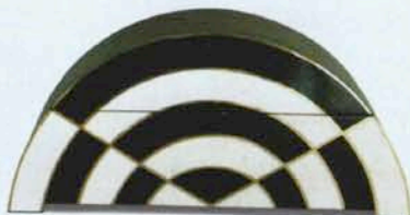
Inlaid stone-and-brass box by Celerie Kemble for Maitland-Smith, $837; maitland-smith.com .