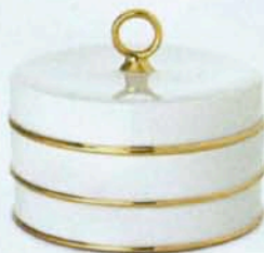
Ovar Finial ceramic box by Plantation Design, $175; plantationdesign.com .