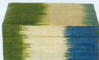
Norton small rattan box by Made Goods, $295; jaysonhome.com .