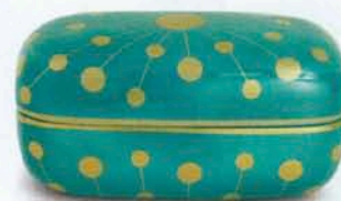
Santorini Pandora porcelain box by Jonathan Adler, $98; jonathanadler.com .