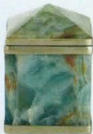
Salta mini onyx box by Airedelsur, $240; jalanmiami.com .