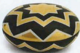
Chevron Egg stoneware box by Waylande Gregory Studios, $295; fortyfiveten.com .