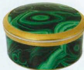
Malachite round Limoges porcelain box by L'Objet, $165; l-objet.com .